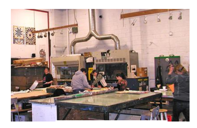
Print Studio Students

Todd then took us on a tour of some of the other studios in the complex, including the Print Studio, Metalworking Studios, and Hot Glass and Cold Glass Studios.