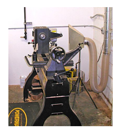
Powermatic Wood Lathe

Todd also showed us the lathe turning area, which is well equipped with five wood lathes, as well as turning tools and sharpening equipment. He noted that unlike the rest of the Wood Studio , time on the lathes can be purchased for only $5/hr . – definitely a bargain rate, particularly for someone in need of a lathe to support a current project.