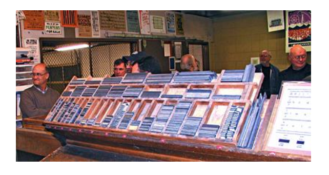
Lead Type Pieces