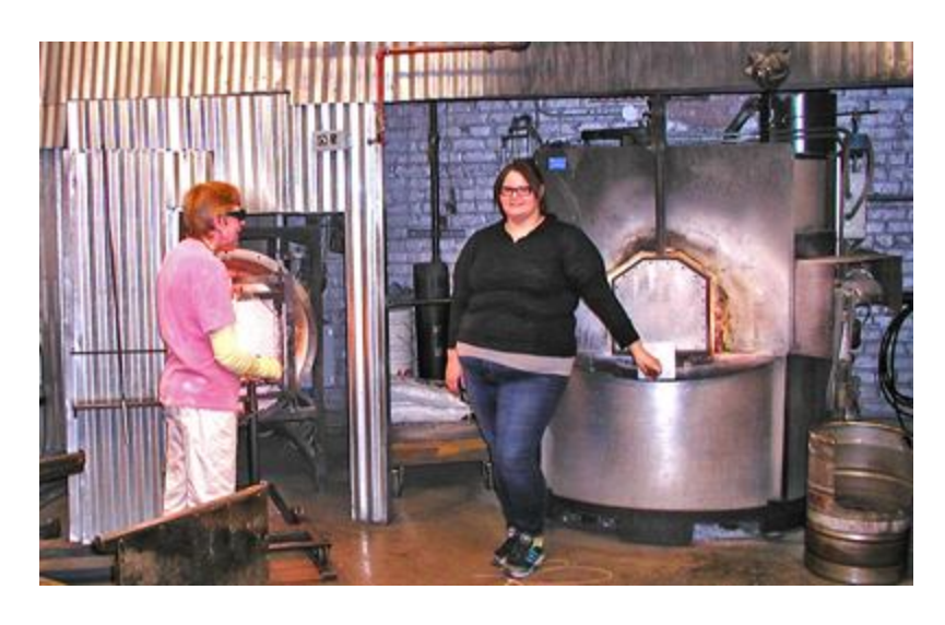
Hot Glass Artists