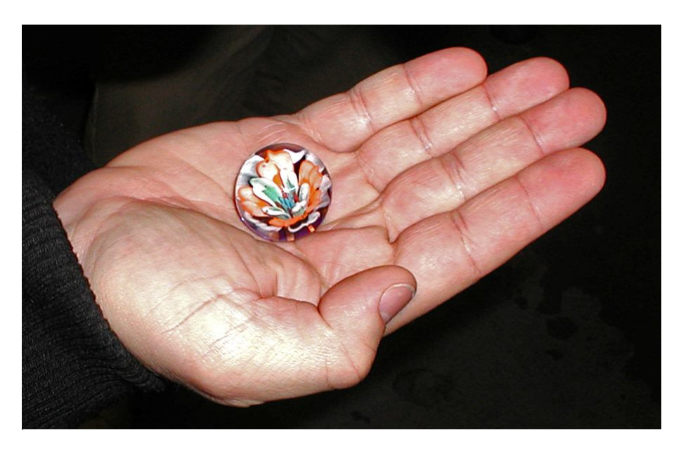
Clear Glass Marble with Embedded Glass Flower