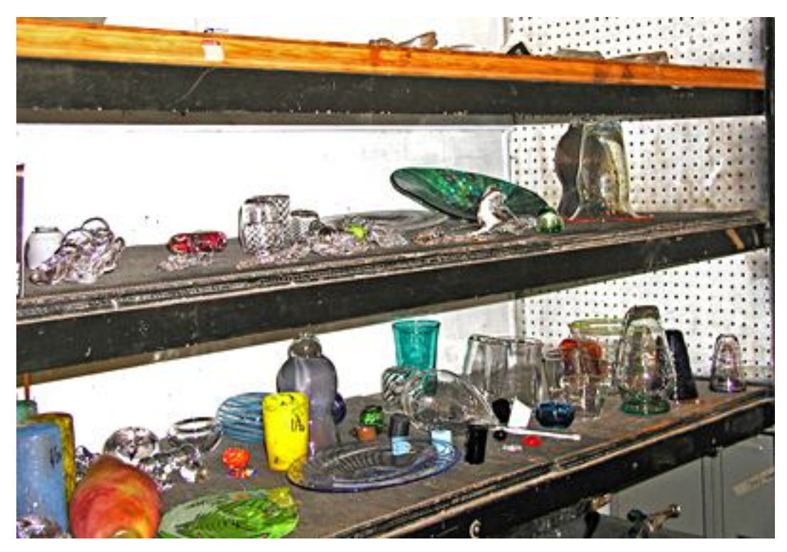
Glass Art Objects